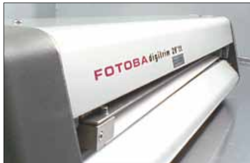
The self-squaring blade follows any printing misalignment