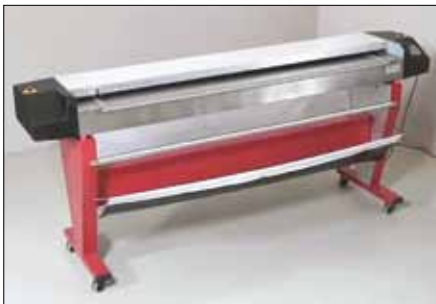
Very easy handling