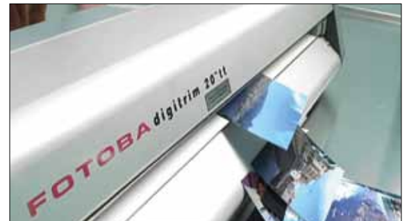
Can cut different sizes in the same roll (Digitrim nesting)