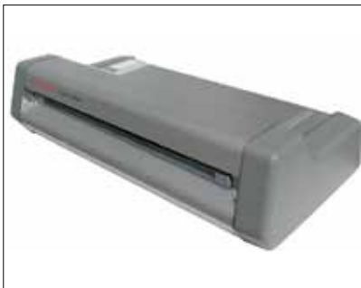
Very easy handling

Using this cutter is very easy and doesn't need a special training